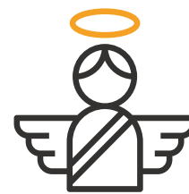
Honest and ethical