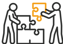
Problem solving and critical analysis