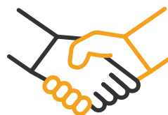
Collaboration and team working